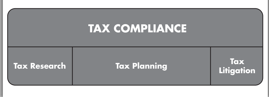
Exhibit 12-3: Tax Planning in the Typical Tax Practice, by Time and Effort of the Professional Staff

The entrepreneurial tax professional should not see tax planning as an end in itself. Rather, especially when dealing with individual clients, tax planning must be seen as part of two sets of major services provided by the practitioner, as illustrated in Exhibits 12-3 and 12-4. As we discussed in Chapter 1, tax planning is part of the